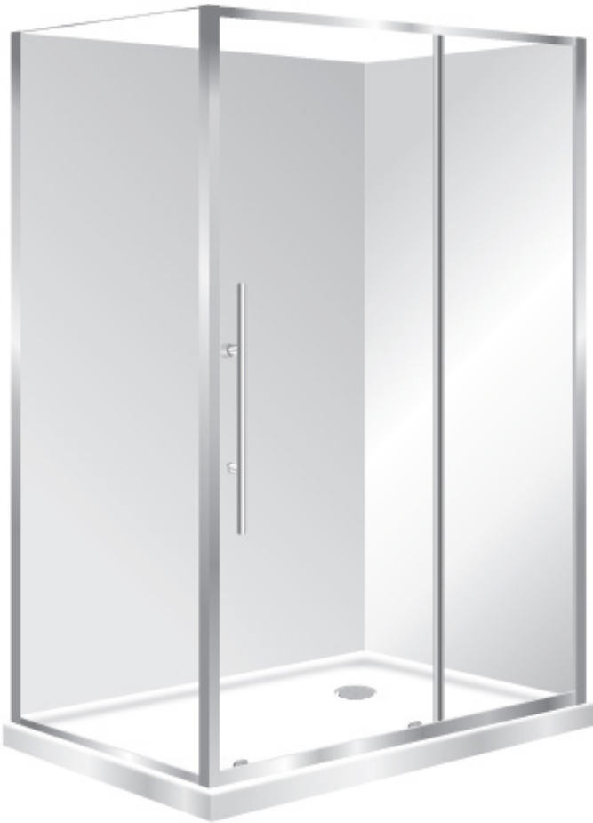
Pictured - Aquero 1200 x 900 2 Panel Sliding Door Right Hand Tray Configuration Flat Wall Silva SKU S12X9AQRSHSIFWZ